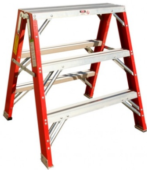
3 ft Fiberglass Work Stand