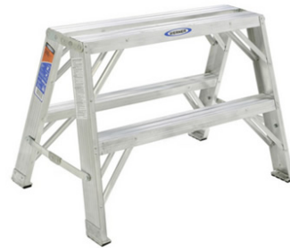
2 ft Aluminum Work Stand