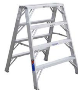
4 ft Aluminum Work Stand