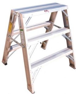
3 ft Aluminum Work Stand