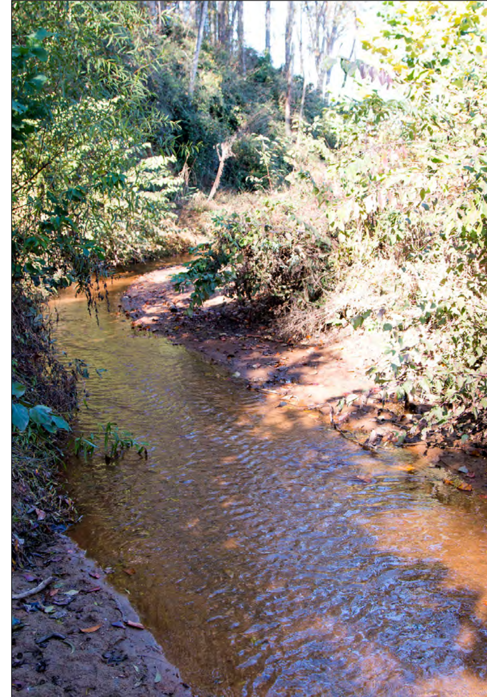
The mitigated portion of the Hunnicutt Creek.

The Clemson students help the Corps by monitoring the creek for not only