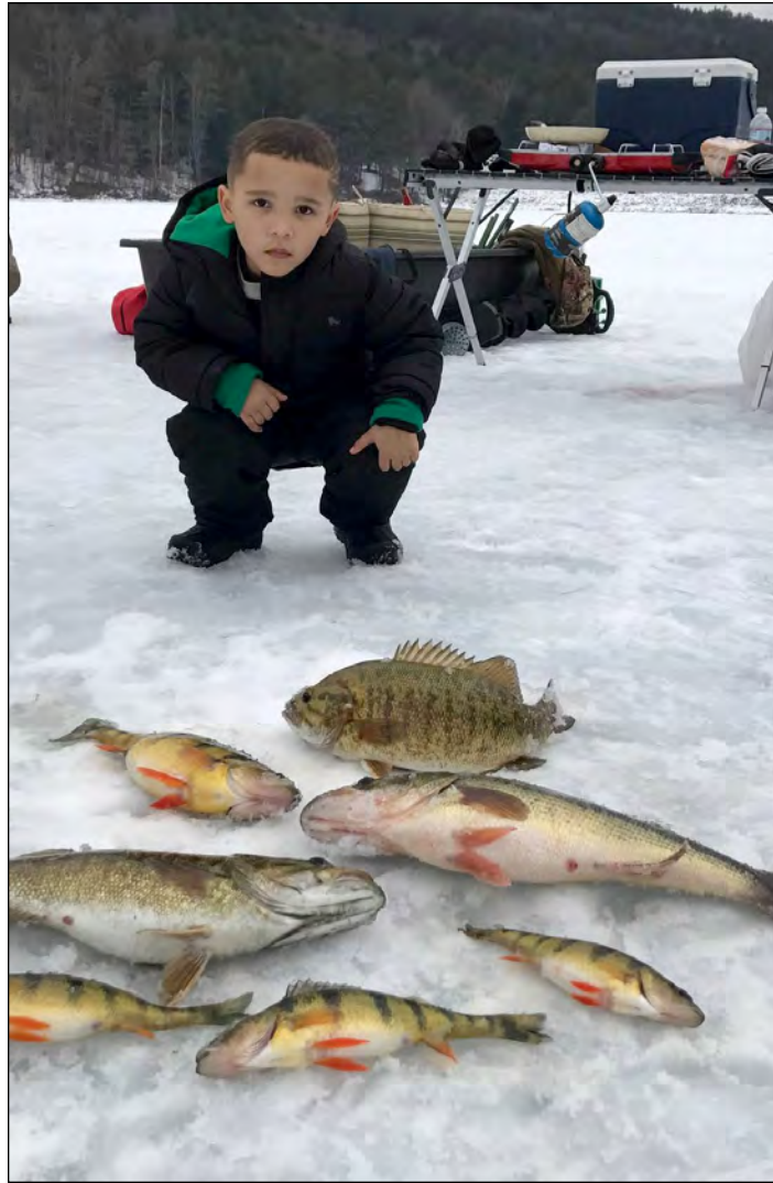
This little angler shows off his catch following the Winter Free Fishing event at Surry Mountain Lake, Jan. 21.

For more information on the project, go to their website at: www.nae.usace.army.mil/Missions/Recreation/Surry-MountainLake.aspx .