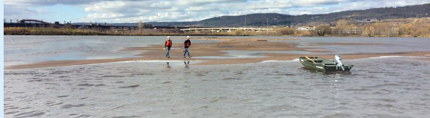
USACE, Detroit District, employees walk across the shoal feature of the 21st Avenue West embayment in Duluth Harbor.