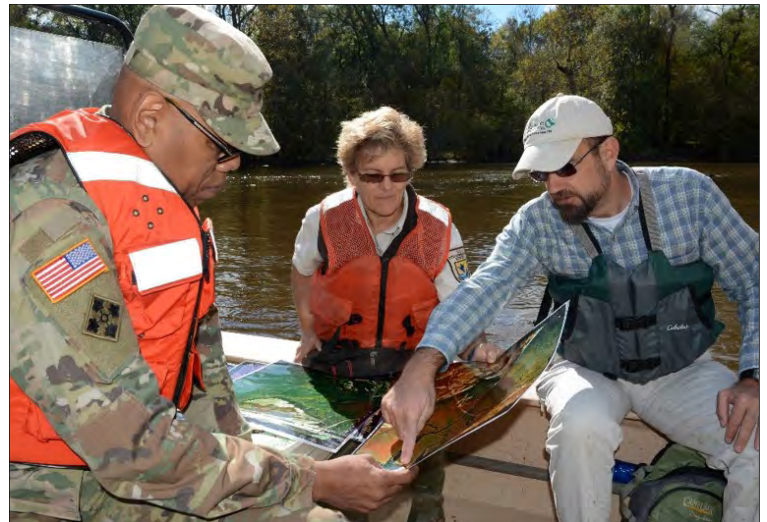
The U.S. Army Corps of Engineers partnered with The Nature Conservancy to ensure the survival of lower basin wildlife on the Roanoke River.

"We have to try and strike a balance that both meets our project's intent, but also incorporating into that solution, the environment and the needs of the stakeholders," he said. "There's a whole myriad of different angles that have to be looked at and addressed in coming up with the optimum solution. Sometimes, we don't ever reach the optimum solution, but at the end of the day we're definitely trying to strike a balance among the stakeholders by collaborating and understanding their needs."