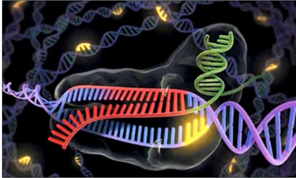
A mechanism called the CRISPR/Cas9 “gene drive” has emerged as a promising genetic bio-control strategy to combat invasive species like carp and mosquitos.

The high efficiency, robust and versatile CRISPR/Cas9 technology also makes it feasible to alter multiple places at the target gene to prevent mutations from blocking the spread of the drive. This makes it possible to quickly develop multiple types of drives to precisely target a specific subpopulation, to protect a population