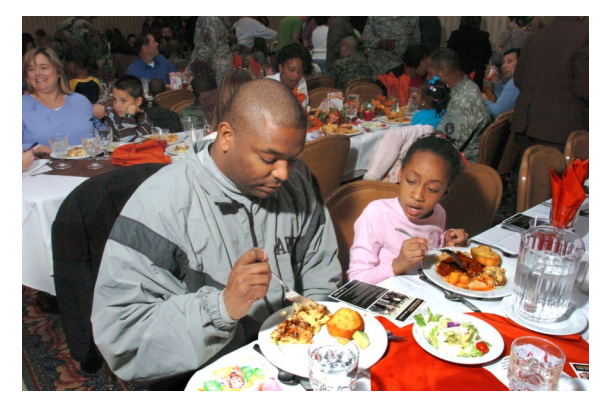
You Are A Vital Player In Our Success!

Operations Security, or OPSEC, is keeping potential adversaries from discovering information needed to keep our Soldiers safe and our missions secret. This information includes, but is not limited to, planned operations, operations in progress, and operations completed. Success depends on secrecy and surprise, so the military can accomplish the mission faster and with less risk. As Family members, be aware that adversaries may target <u>you</u> to obtain information.