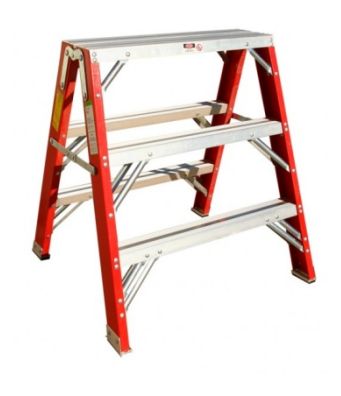
3 ft Fiberglass Work Stand