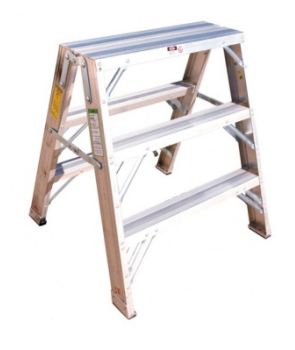
3 ft Aluminum Work Stand