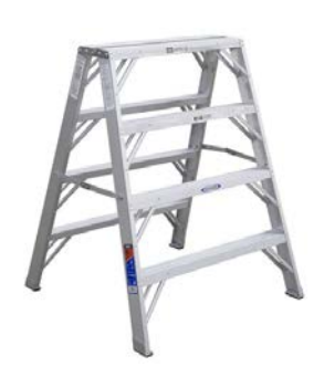
4 ft Aluminum Work Stand