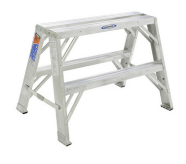
2 ft Aluminum Work Stand