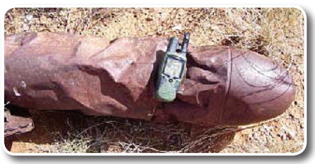
Practice bomb at former Midland AAF

Because explosive hazards associated with military munitions from past military training may remain in the former Midland Army Air Field Ordnance Burial Pits No. 1 & 2, the U.S. Army Corps of Engineers recommends landowners and visitors follow the 3Rs of Explosives Safety – Recognize, Retreat, and Report.