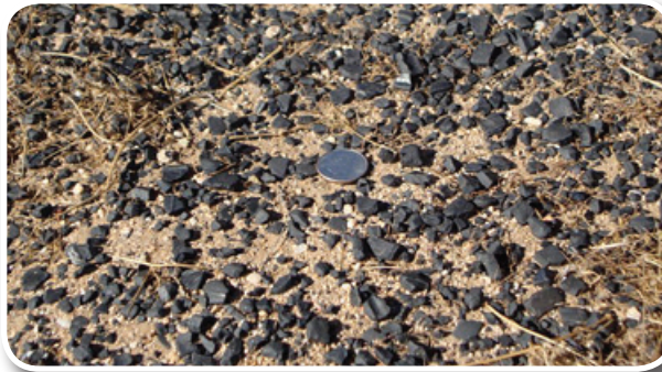
Example of skeet target fragments

The former Dalhart Army Air Field is located in Hartley County, Texas, just south of the city of Dalhart. Today, the city of Dalhart operates the Dalhart Municipal Airport on a large portion of the former air field property. The rest of the former air field property is used for residential and agricultural purposes. As depicted on the inside map, the Double Skeet Range is located at the northern end of the municipal airport.