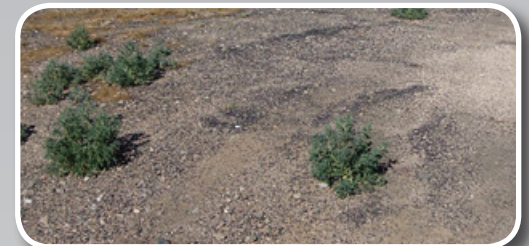
Example of skeet target fragments