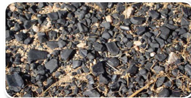
Example of skeet target fragments

otherwise possessed by the Department of Defense. Army is the lead agent for the FUDS Program and the Army Corps of Engineers executes the program on behalf of the Army and DOD. The U.S. Army Corps of Engineers is responsible for identifying, investigating and, when necessary, conducting an appropriate response to address such contamination and military munitions resulting from past DOD activities.