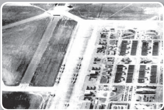
Parking ramp and station area of Dalhart Army Air Field, 1944